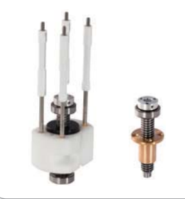
Smooth Operation from 'precision pitch change' mechanism ensuring low backlash and vibration free performance.