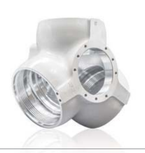
Superior Strength from fully machined, one piece hub.