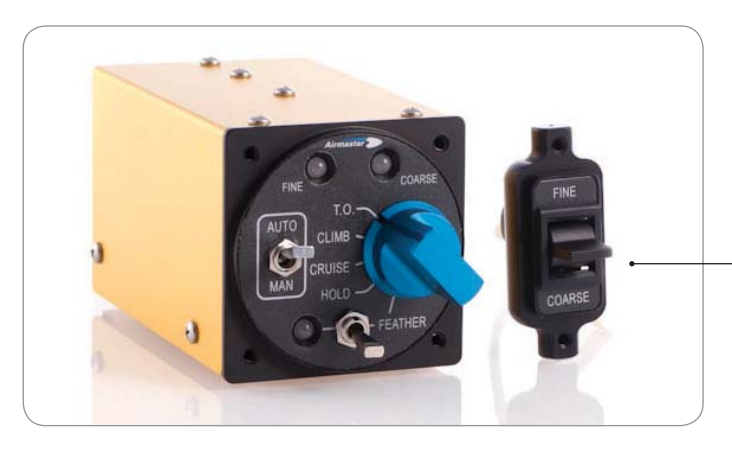
Easy to Operate with simple selection of engine speeds for TakeOff, Climb and Cruise.