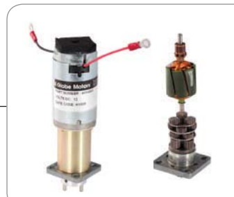
Electric Actuation using a quality servo gearmotor

Each Airmaster propeller is crafted to the specific requirements of your aircraft and engine combination. We supply a full system incorporating CS hub, composite blades, CS governor, spinner, extensions, wiring and hardware.