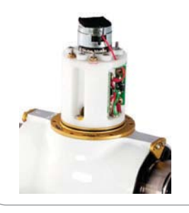
Simple Set-up with fully user adjustable pitch stops.