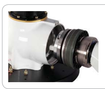
Easy Installation and maintenance due to removable blade cartridge.